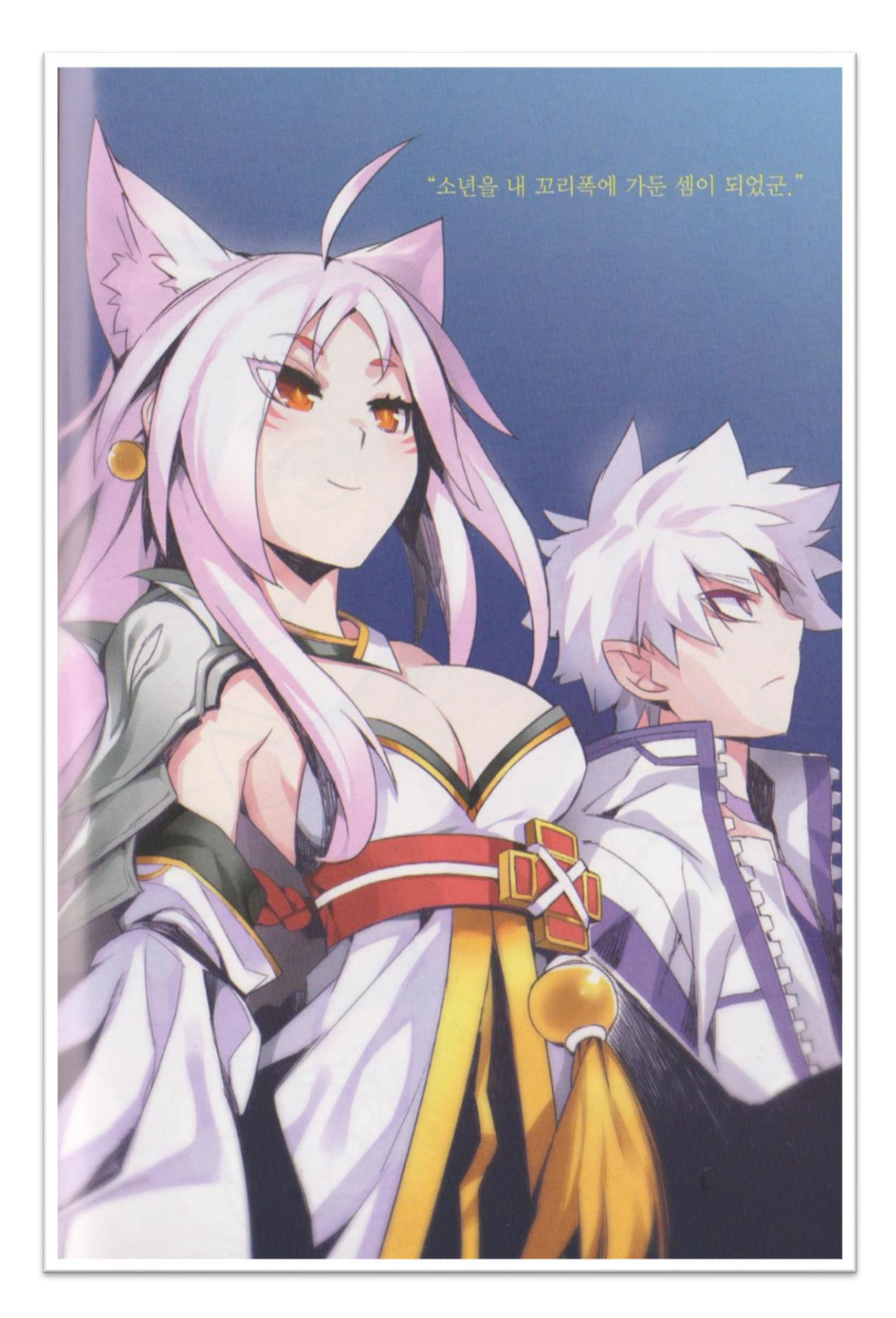
"Looks like I trapped boy within my tails."