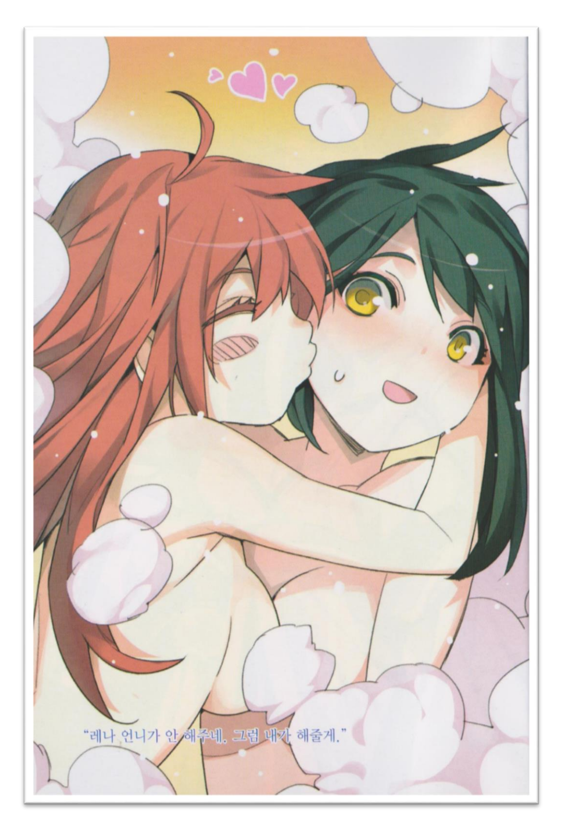
"If Big Sister Rena won't give you one, then let me give you one instead Ara."